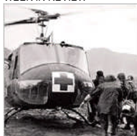
Killed in Action, but Not by the Enemy