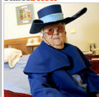
Barry: The Coroner of Munchkin City