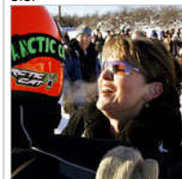
Pipeline Puts Alaska's Governor on the Spot